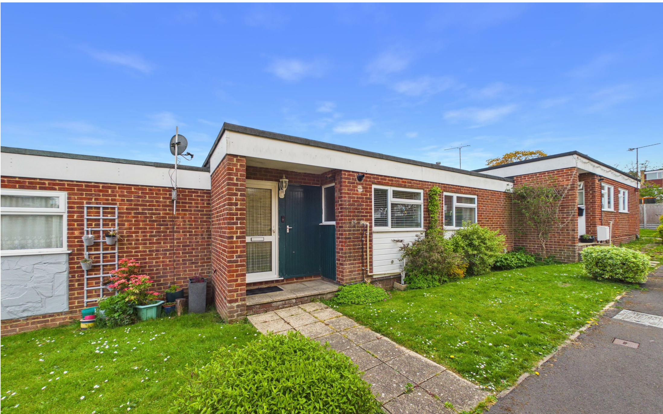
Thames Court, Basingstoke, RG21 4DP £290,000 Asking price - Leasehold